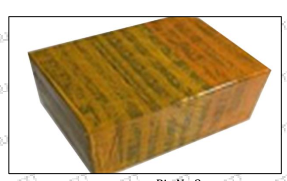
Pic No.3 International express packaging: Wrapped with yellow tape after wrapping black protective film g^{(i)}

Mob/Whatsapp: +86 13410541523 Tel: +8675523215133